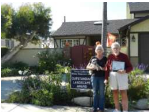
The Merritt residence - 621 Paseo de los Reyes