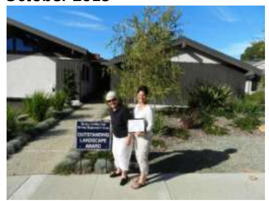
The Low Residence - 5213 Calle de Arboles